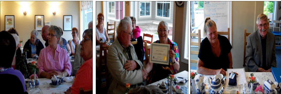
The Blue Willow Tea Room was the venue for the Society's 2011 Volunteer Appreciation Awards. Above are some of the candid shots taken during the evening's festivities.

June is our traditional month to celebrate the efforts of and thank our valuable volunteers. A strawberry social brought a record number of volunteers together to the Blue Willow Tea Room on June 28.